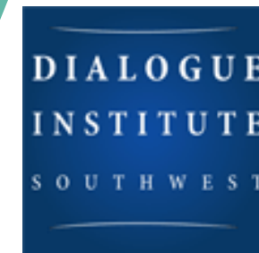
Dialogue Institute Southwest Houston, TX