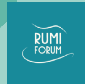
Rumi Forum Washington, DC